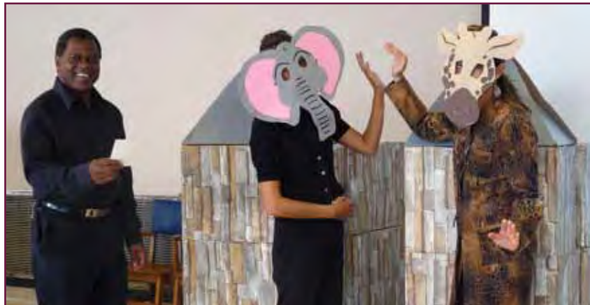
A reenactment of a fable is part of the ProActors' Building a House for Diversity program

For its ongoing commitment to diversity outreach efforts, the Diversity ProActors have been recognized both locally and nationally. The National Association for College Auxiliary Services in 2007 recognized the diversity efforts of the HFS division, including the contributions of the ProActors, as did CUPA-HR in 2011 with its SunGard Higher Education Innovation Award. In 2008, the HFS